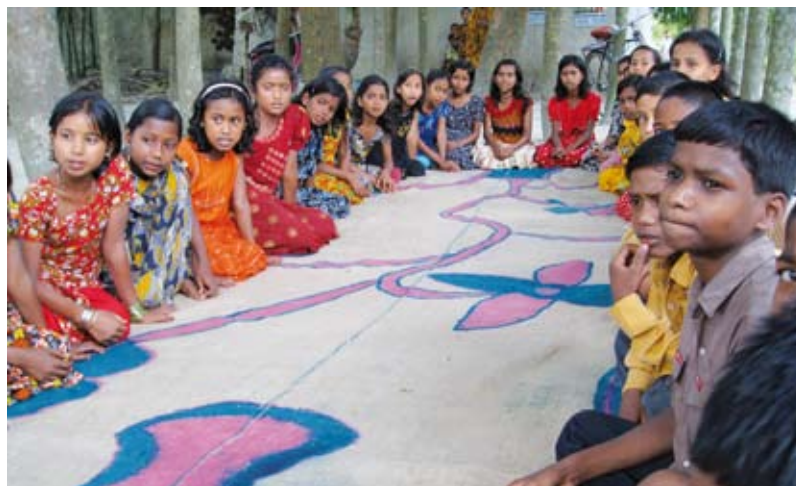
Community school in rural Bangladesh