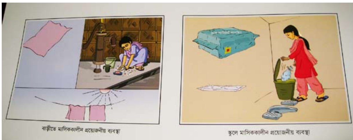
Educational material on menstrual management used by BRAC-WASH programme in Bangladesh

The research initiatives to date have generally utilized qualitative, ethnographic, and case study methods and more recently quantitative measures. Although some educational survey research has queried girls about menstrual-related interruptions to their schooling, the sensitivity of the topic may have hindered the validity of the data collected. There is an overdue need for longitudinal research on girls' transitions through puberty in developing countries, and for quantitative measurement of the impact of menstrual and pubertal-related interventions on girls' school attendance and completion.