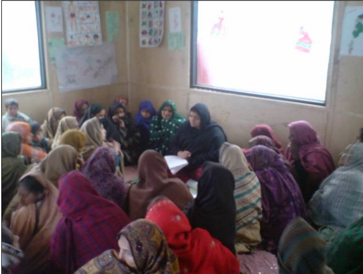
Picture details: FGD with Women, Chattar Camp, Bagh District, taken by NWDA, February 2007