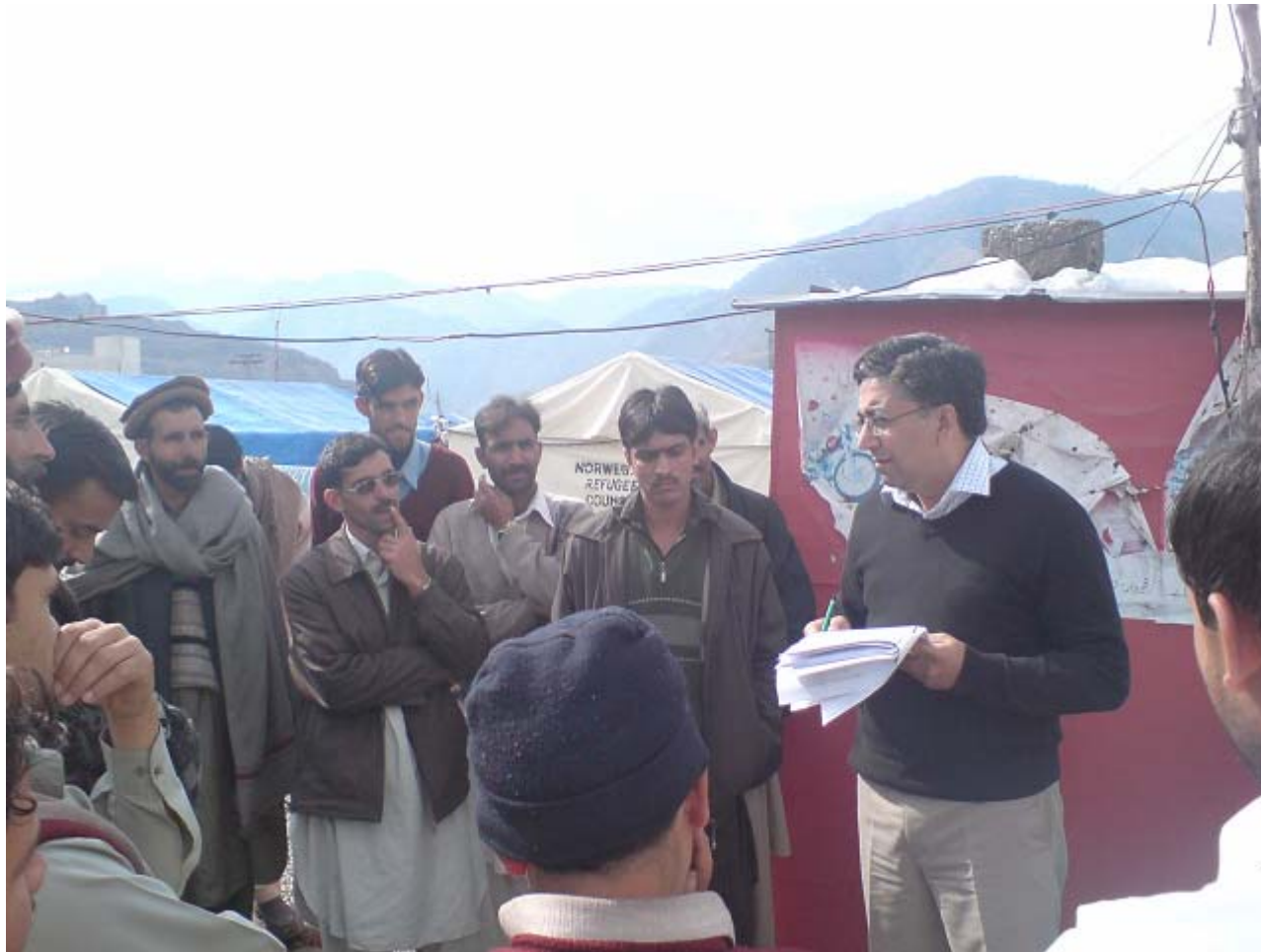
Picture details: FGD with Men, Narrul Camp, Muzaffarabad District, taken by NWDA, February 2007