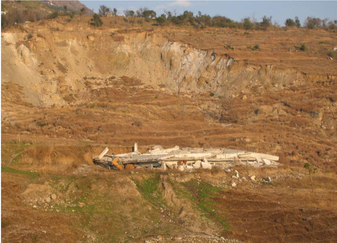
Picture details: Muzaffarabad, AJK Province, IRC International Water and Sanitation Centre, February 2007.