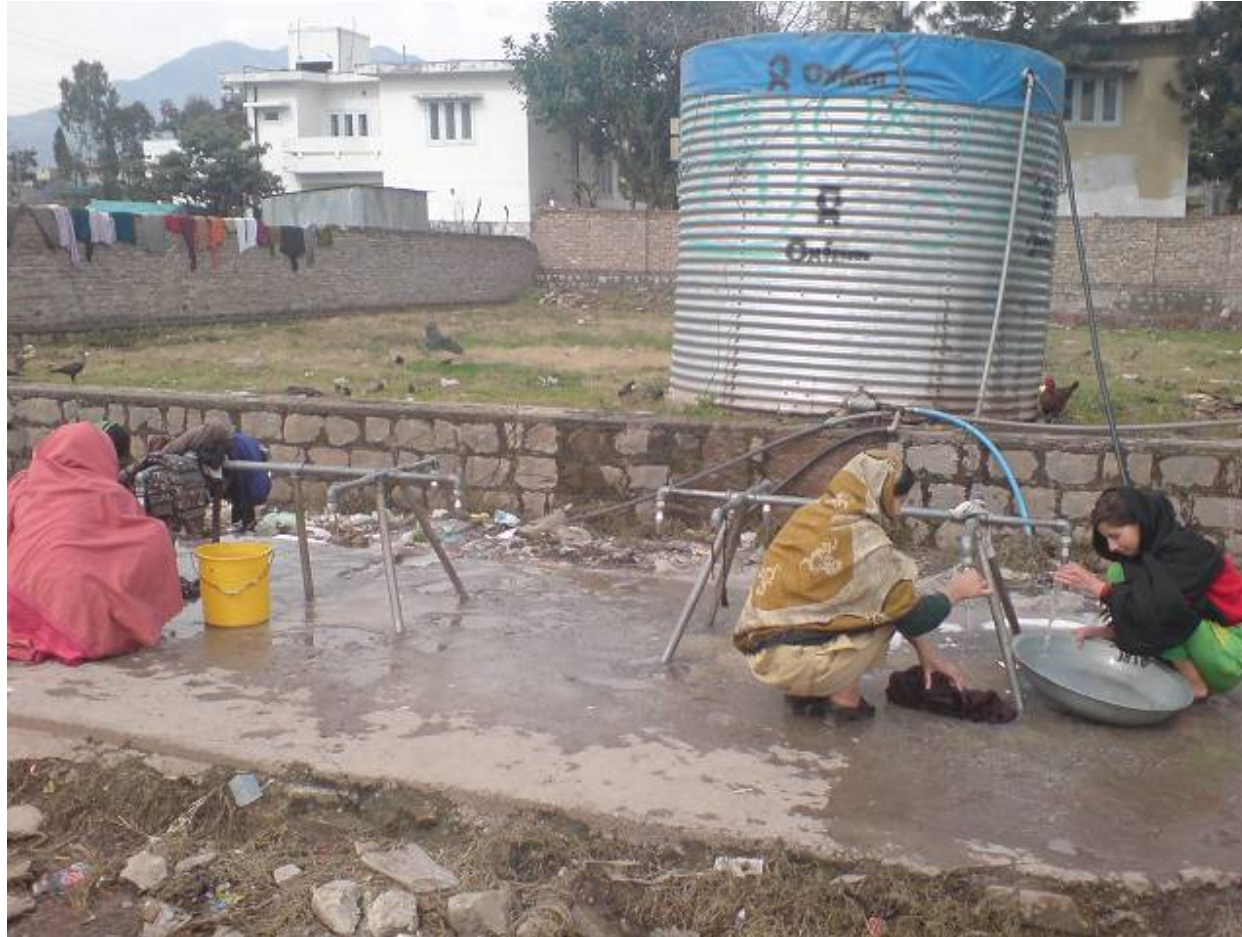
Picture details: Women at Oxfam-supported Washing Point, Narrul Camp, Muzaffarabad District, February 2007